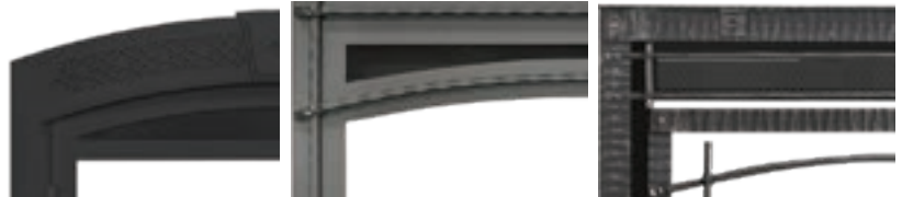
Black surround with safety barrier