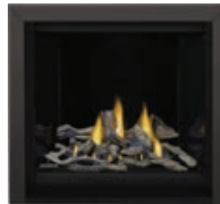
Altitude X | Elevation X