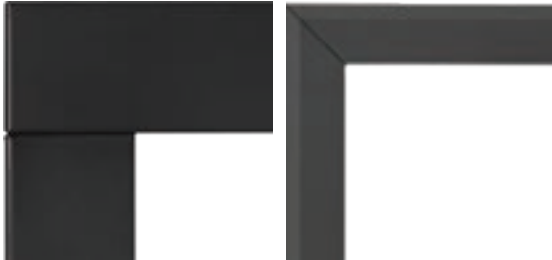
Black 3" trim