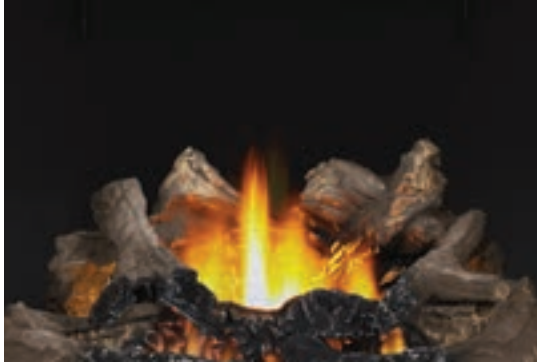
Split oak log set