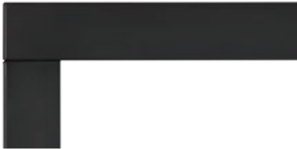
Black 3" trim