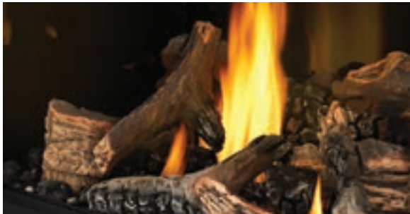
Split oak log set