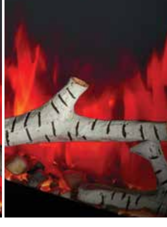
OPTIONAL: Driftwood Logs, Birch Logs