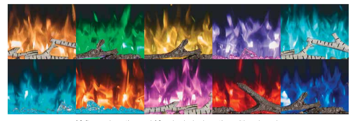
10 flame color options and 10 ember bed color options with cycle mode