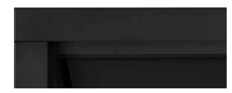
Classic black surround