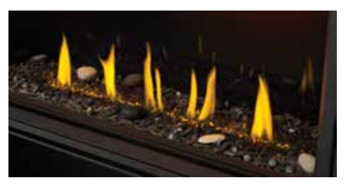
OPTIONAL ENHANCEMENT KITS: Beach Fire, Mineral Rock, Woodland (Glass Beads and Embers can be added to any log set as well)