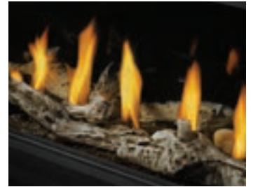
Beach fire kit