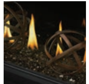
Wrought iron globes