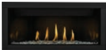
Ascent™ Linear Premium