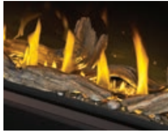
High-definition driftwood logs