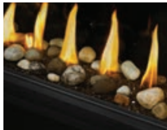
Mineral rock kit