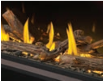
High-definition oak logs

Recommended: Combination of logs with glass beads, embers or optional enhancement kit or glass, or media/glass on its own