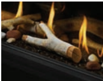
Birch log kit