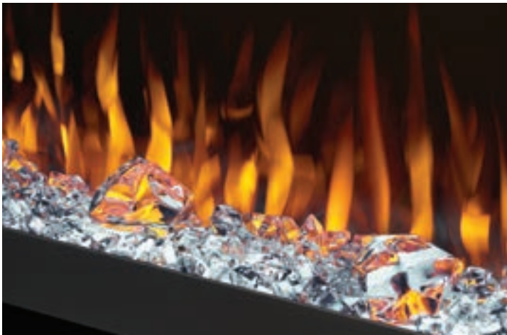
Included: large and small clear crystals