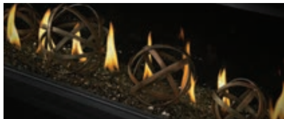
Wrought iron globes