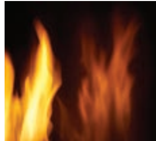
MIRRO-FLAME ® Porcelain Reflective Radiant Panels