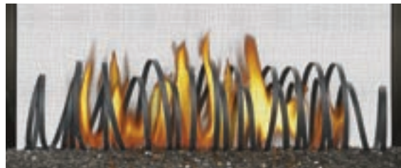
Art metal coil