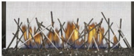
Nickel stix designer fire art