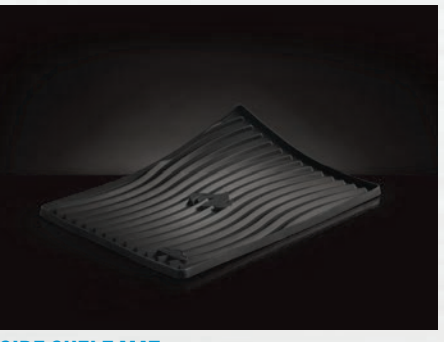
SIDE SHELF MAT