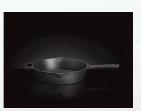
CAST IRON FRYING PAN 56053