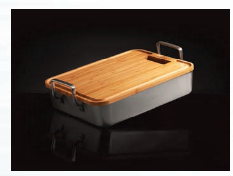
PREMIUM STAINLESS STEEL ROASTING PAN WITH BAMBOO CUTTING BOARD 56033