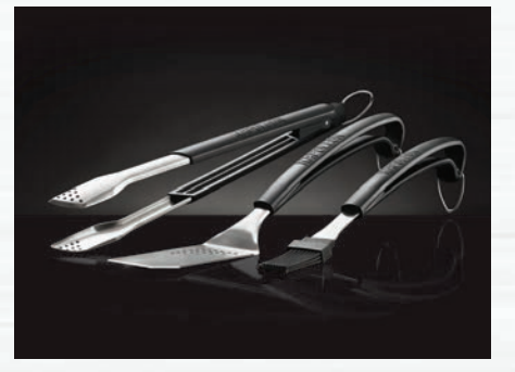
3 PIECE TOOLSET