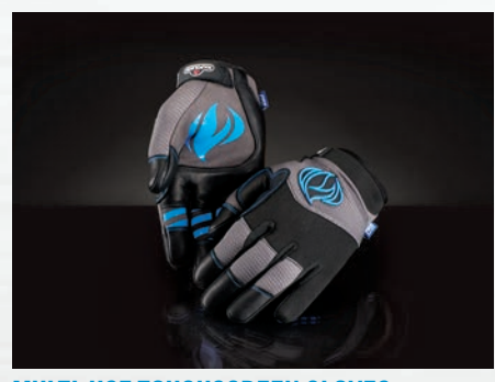
MULTI-USE TOUCHSCREEN GLOVES 62141 (S/M) 62142 (L) 62143 (XL / XXL)