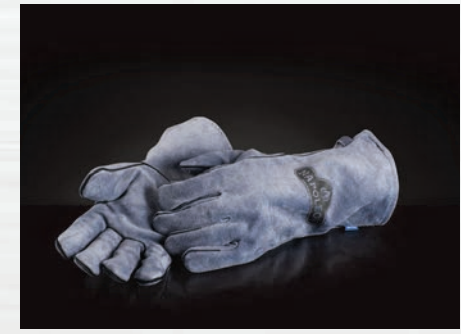
GENUINE LEATHER BBQ GLOVES 62147