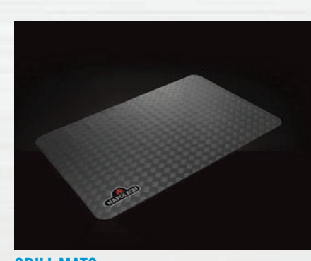
GRILL MATS 68001/68002