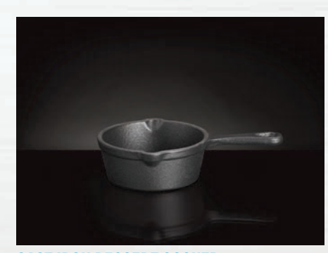
CAST IRON DESSERT COOKER 56054