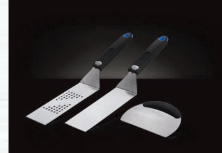
3 PIECE PLANCHA TOOLSET