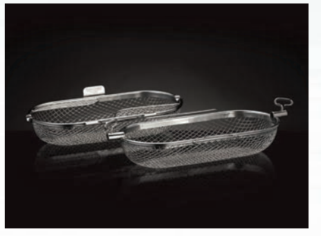
ROTISSERIE GRILL BASKET 64000