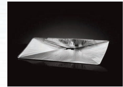
DRIP PAN LINER 62004/20/21/22