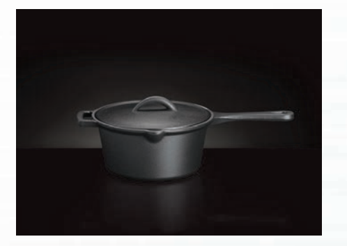
CAST IRON SAUCE PAN WITH LID

Visit napoleon.com to see Napoleon's complete line of grilling accessories.