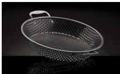
STAINLESS STEEL GRILLING WOK