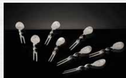
APPETIZER SERVING SET AND CORN FORKS