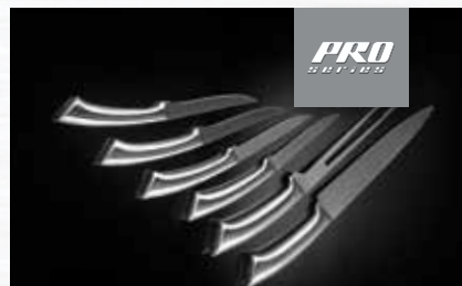
PROFESSIONAL KNIFE / CARVING SET