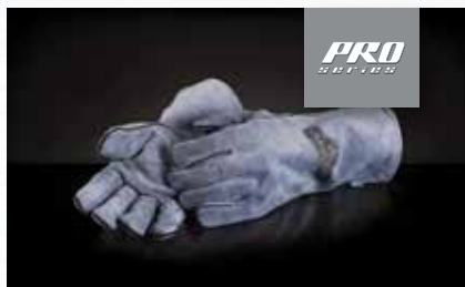
PRO GENUINE LEATHER BBQ GLOVES