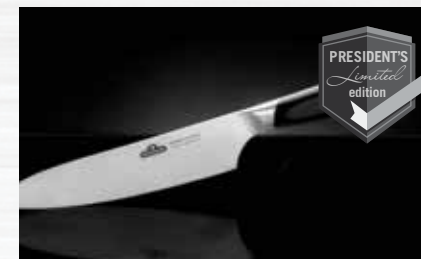
EXECUTIVE CHEF KNIFE