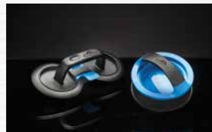
GOURMET BURGER PRESS KIT