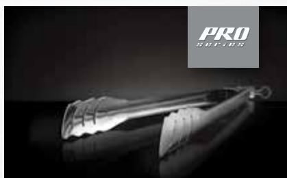
STAINLESS STEEL EASY LOCKING TONGS