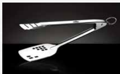
STAINLESS STEEL SPATUTONG