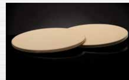
10" PERSONAL SIZED PIZZA / BAKING STONE SET