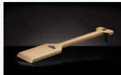
CEDAR GRILL SCRAPER