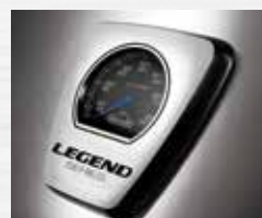
ACCU-PROBE™ TEMPERATURE GUAGE