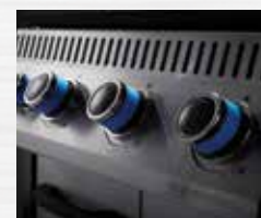
SOLID ERGONOMIC CONTROL KNOBS