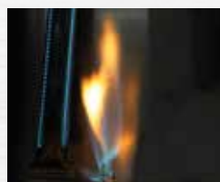
INSTANT JETFIRE™ IGNITION