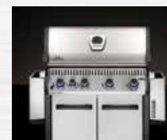
FOLDING SIDE SHELVES