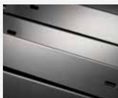
DUAL-LEVEL STAINLESS STEEL SEAR PLATES