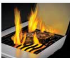
INFRARED SIZZLE ZONE™ SIDE BURNER (LD4X MODEL)