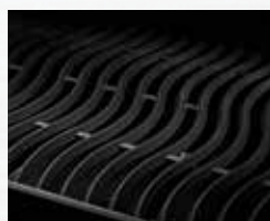
PORCELAINIZED CAST IRON ICONIC WAVE™ REVERSIBLE CHANNEL COOKING GRIDS