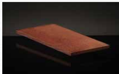
WINE SOAKED CEDAR GRILLING PLANK