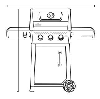
Dimensions: Lid Open: 60.5"H x 48.75"W x 25"D Lid Closed: 45.5"H x 48.75"W x 25"D