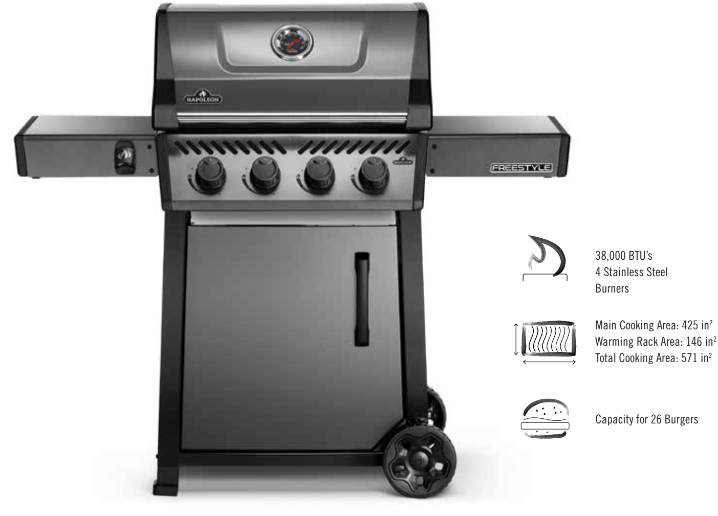
Available in Propane and Natural Gas F425DPGT / F425DNGT