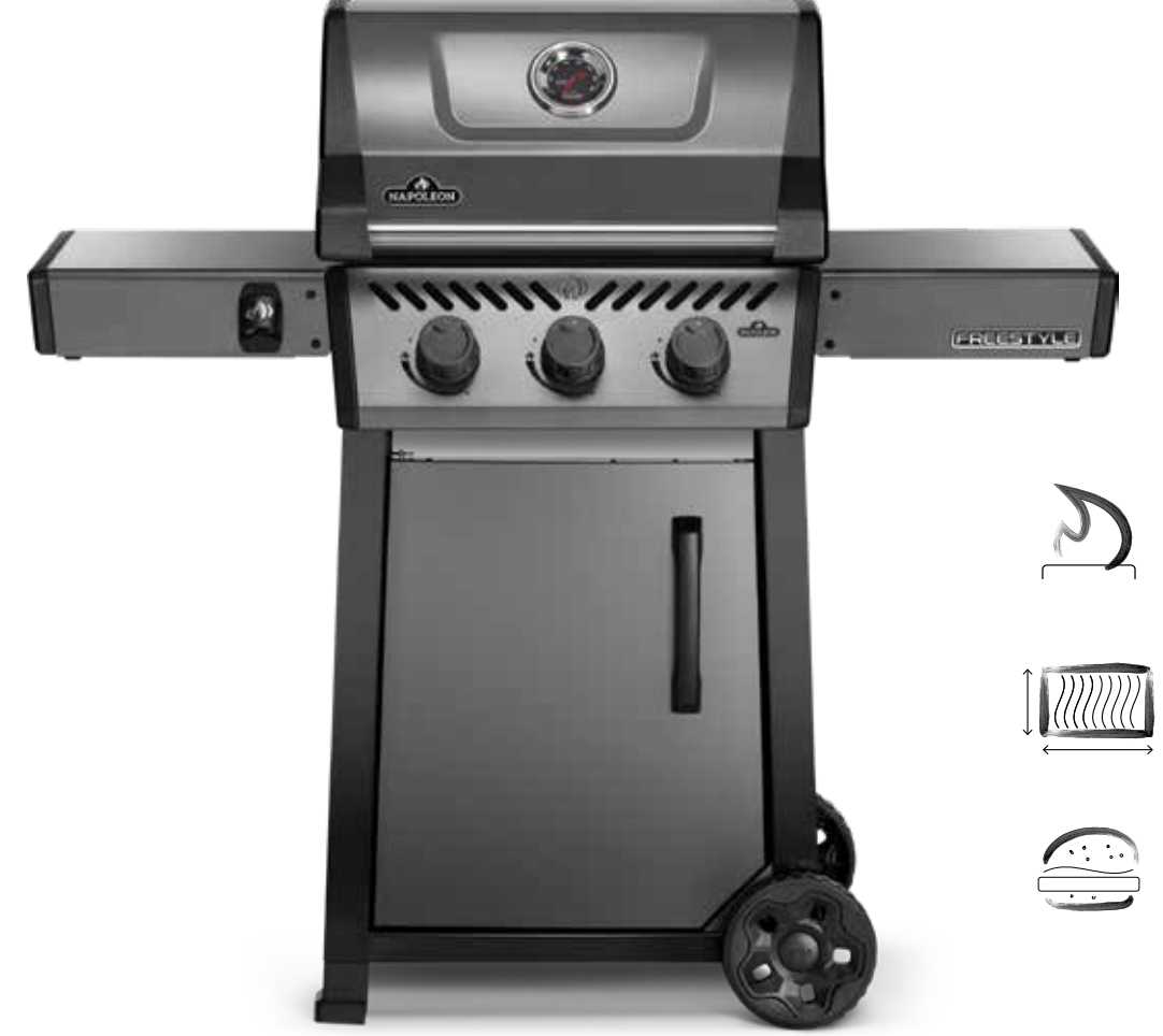
Available in Propane and Natural Gas F365DPGT / F365DNGT