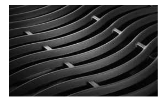
WAVE™ COOKING GRIDS

Cross-lighting technology ensures that if a burner accidentally goes out while lit, it will automatically reignite.