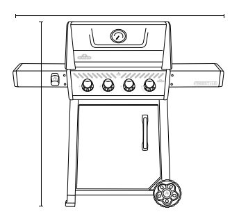
Dimensions: Lid Open: 60.5"H x 52"W x 25"D Lid Closed: 45.5"H x 52"W x 25"D